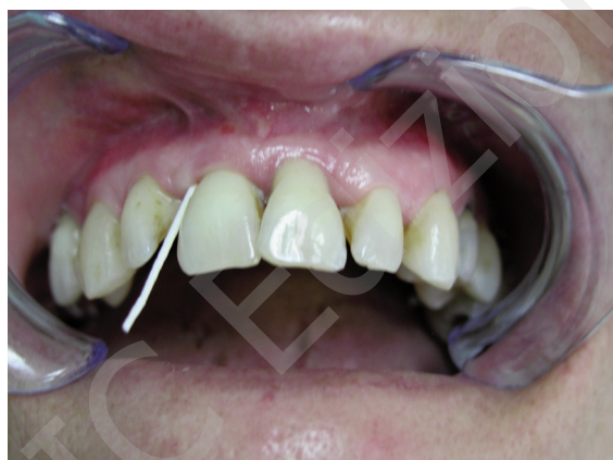
Figures 2 Method of sampling bacterial DNA.

of these three species among groups of patients with different diagnosis - regardless of different clinical aspects that may describe severity of the disease – in order to understand whether the presence of the red complex species and their relative amount may be considered predictive factors of periodontitis.