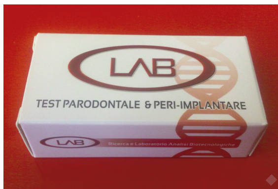
Figure 1. LAB®-test kit.

Occurrence and amount of red complex bacteria from crevicular fluid were evaluated in 146 individuals. A single specimen from each patient was analyzed by quantitative real time PCR (LAB test LAB® s.r.l, Ferrara, Italy) (Figs. 1, 2), obtaining measures of total bacteria load and of three species involved in periodontitis, i.e. P. gingivalis , T. forsythia , and T. denticola . Here we report a preliminary study focused mainly on prevalence